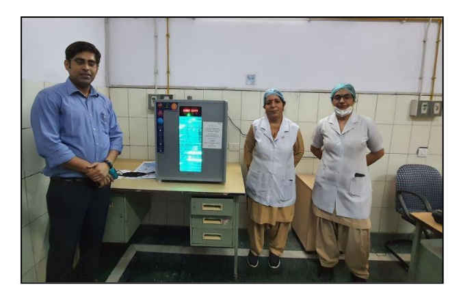
6. Acharyashree Bikshu Hospital