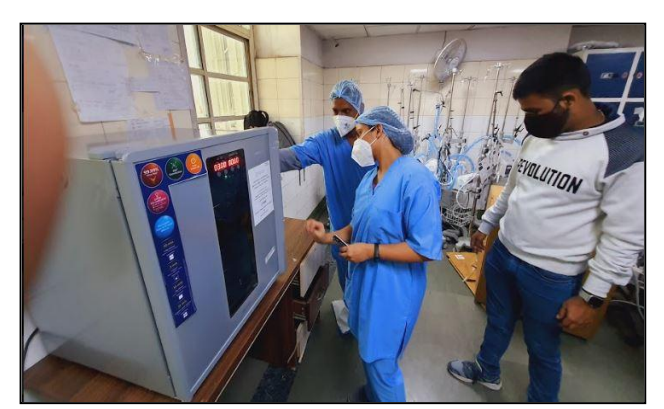
12. Homeopathy Hospital, Preet Vihar