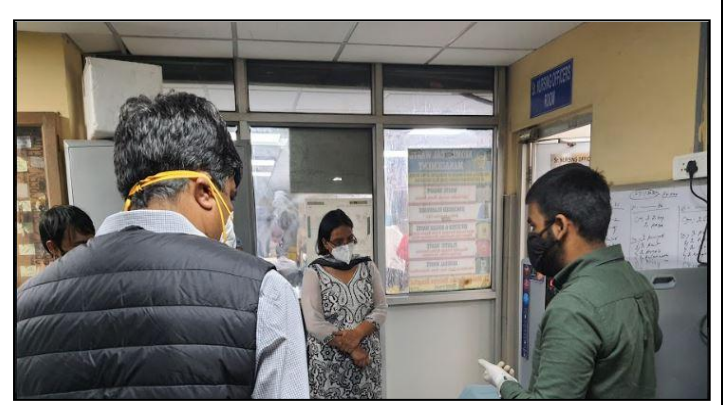
9. Rao Tularam Hospital