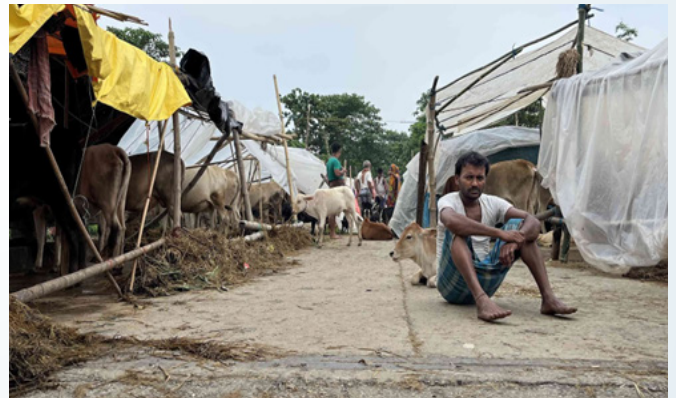
Image 4: Displaced from village a resident takes shelter at a bridge .