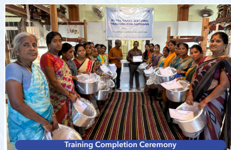
Training Completion Ceremony