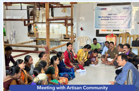
Meeting with Artisan Community