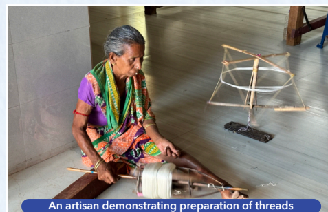
An artisan demonstrating preparation of threads