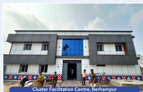
Cluster Facilitation Centre, Berhampur