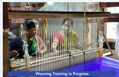
Weaving Training in Progress